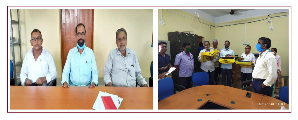
Farewell Programme of our beloved NTSs, June 30th, 2021