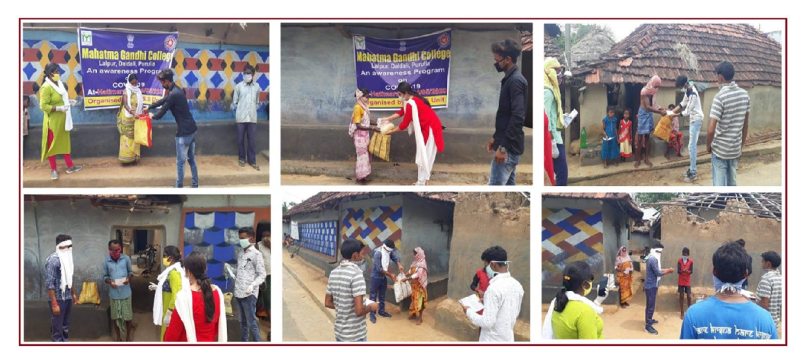
Food, mask and sanitizer distribution programme in Hatimara village with the help of NSS Unit of Mahatma Gandhi College, 2020