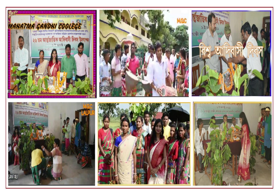
26th International Adibashi (Indigenous People) Day celebration