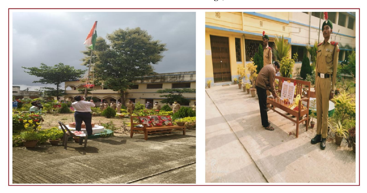
Independence Day celebration, 2020;