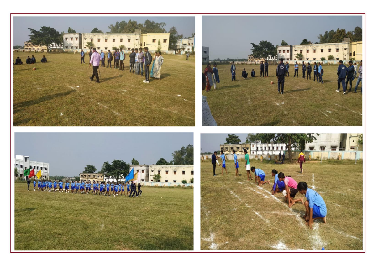
Glimpse of sports, 2019