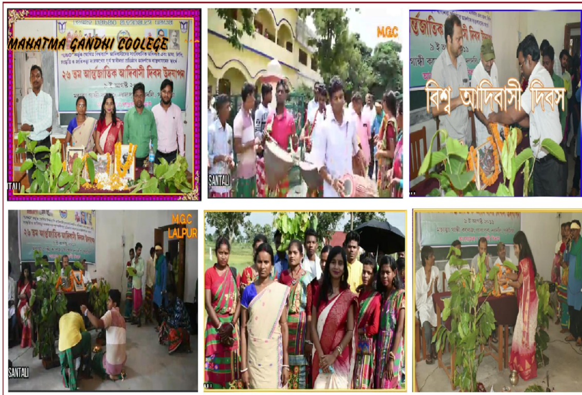
26 th International Adibashi ( Indigenous People) Day celebration