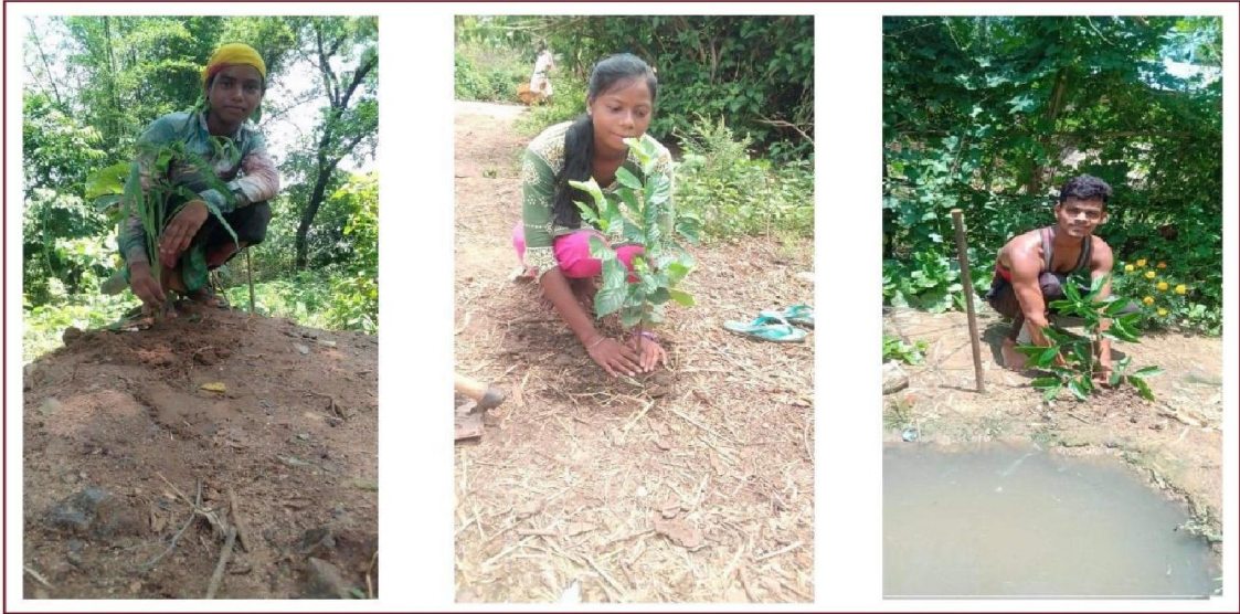
Tree Plantation by NSS students on 5 th June 2021