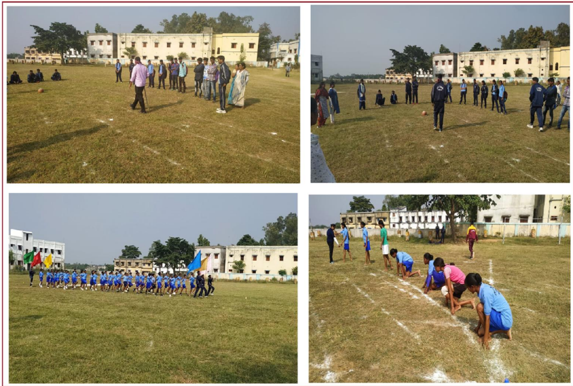
Glimpse of sports, 2019