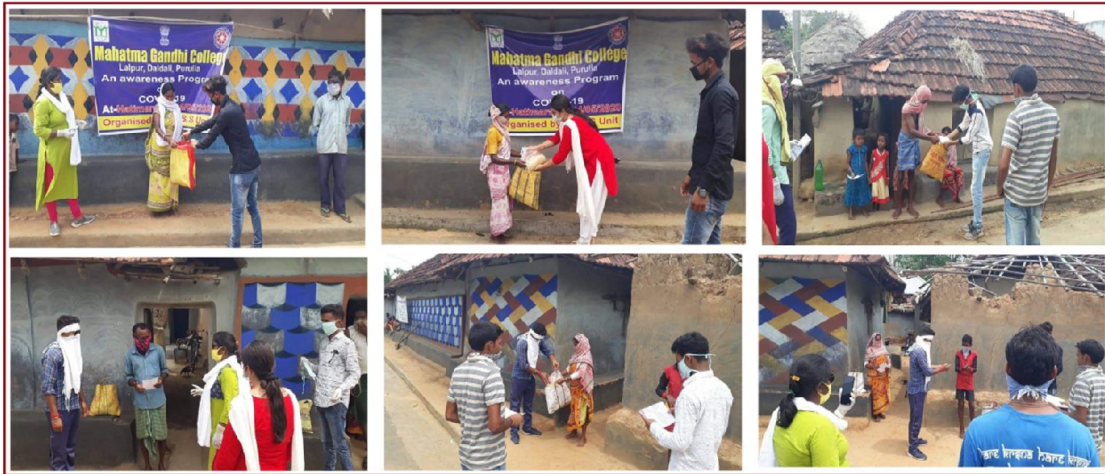
Food, mask and sanitizer distribution programme in Hatimara village with the help of NSS Unit of Mahatma Gandhi College, 2020