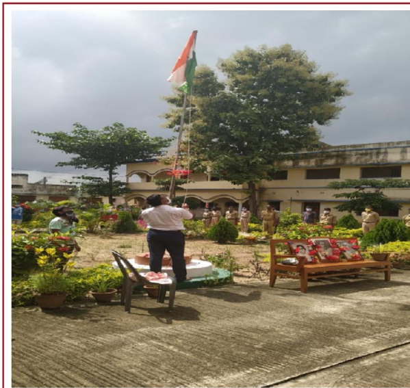
Independence Day celebration, 2020;