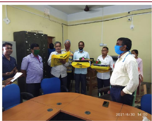
Farewell Programme of our beloved NTSs, June 30 th , 2021