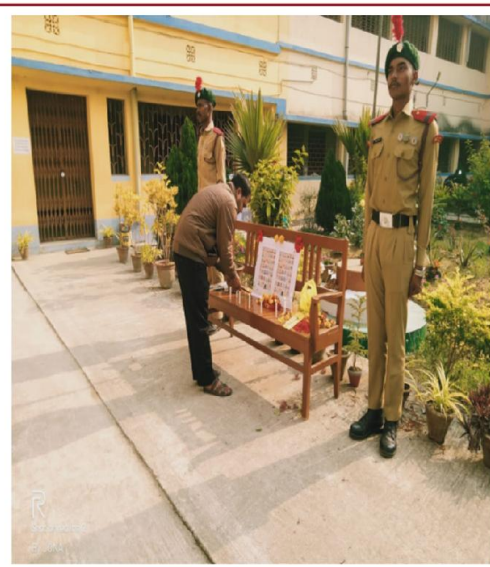
International Language Day celebration, 2021