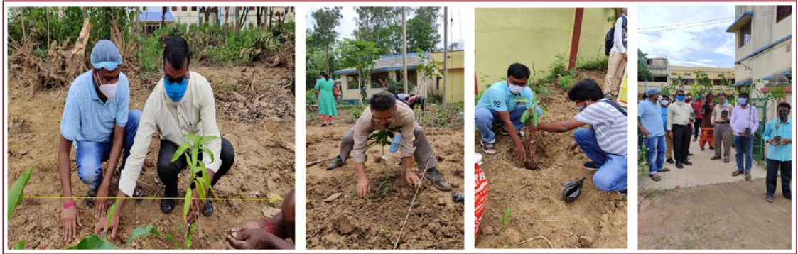
Tree Plantation programme by teachers, July 2021